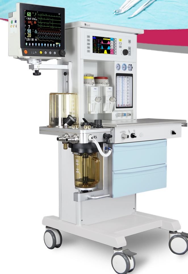
Atlas N3 Anesthesia Machine